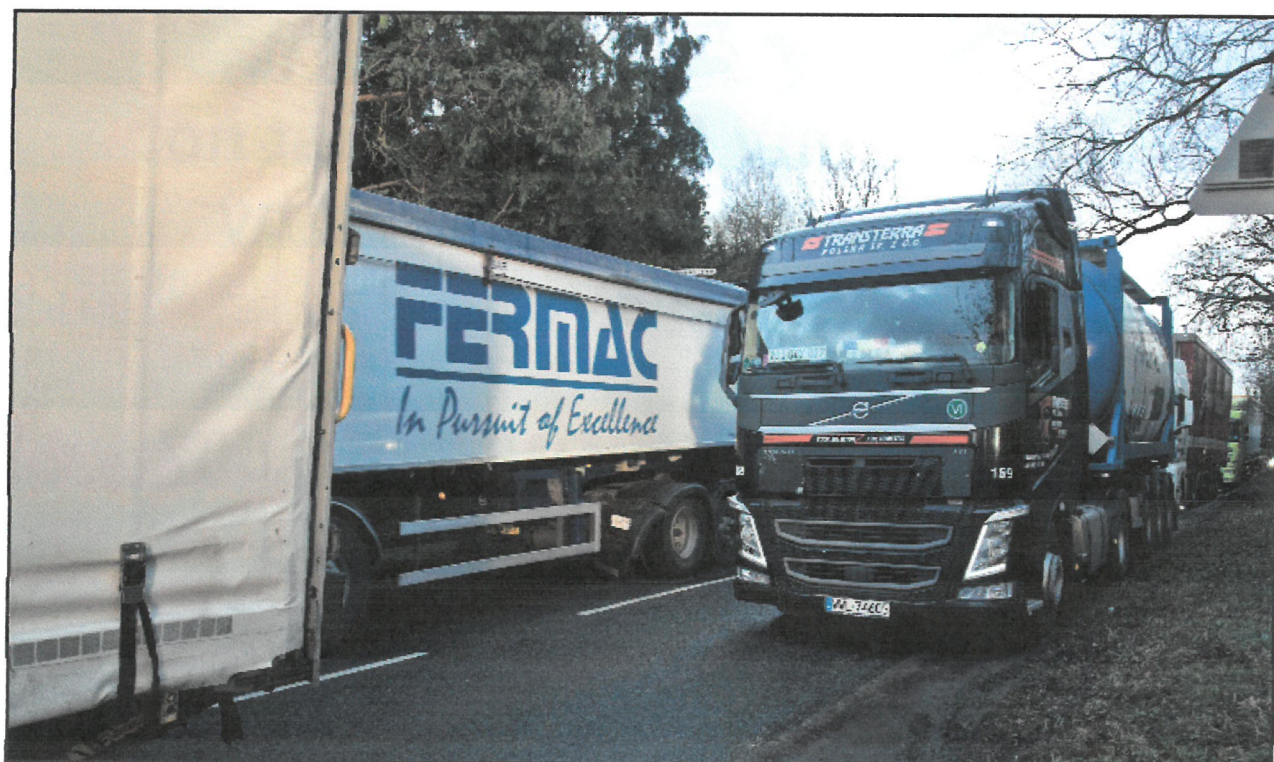
Pedestrians could not use the pavements, as lorries drove over them and then simply parked up when they could move no further.