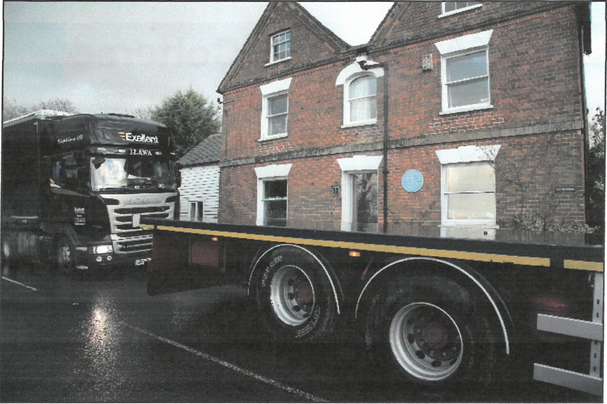
HGVs of all sizes lined up outside Cottered's 37 vulnerable listed buildings, parking on pavements and verges as the wedged lorries (see front cover) stopped traffic for over an hour.