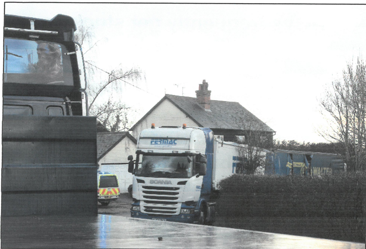
The view over this flatbed, taking up the whole of the pavement as it parked, shows the damage to one of the wedged lorries.