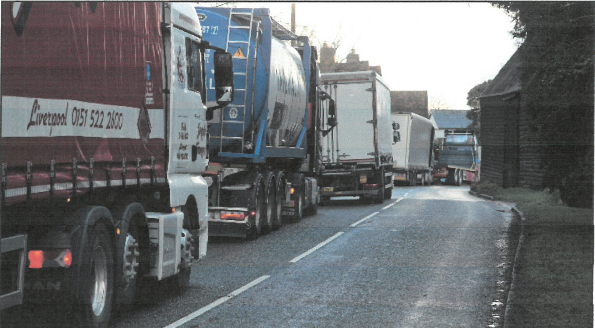
We spoke to many of these HGV drivers. They had been diverted off the M11 and were looking for an alternative route. Their SatNavs showed them an 'A' road with no weight limit - the A507!